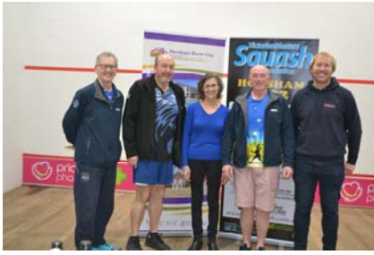
Organisers and Mayor of Horsham